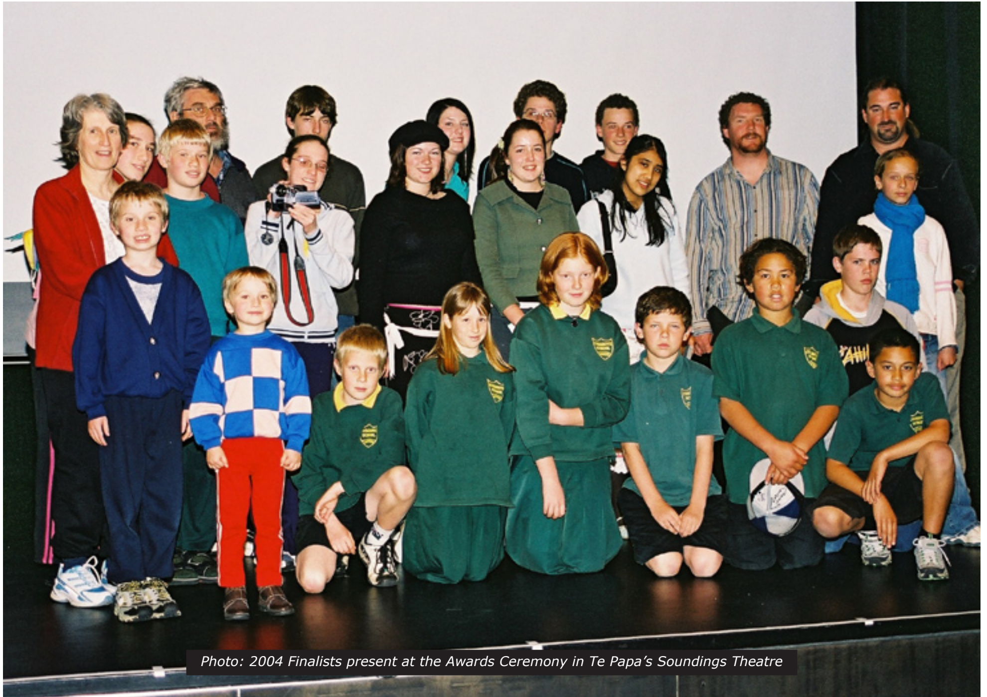
Photo: 2004 Finalists present at the Awards Ceremony in Te Papa's Soundings Theatre