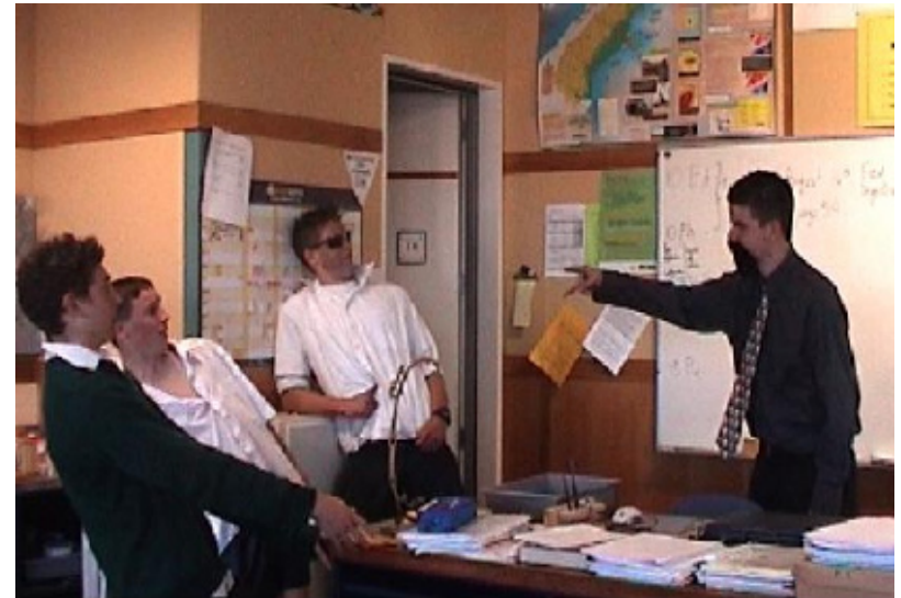
Photo: Scene from a 2003 MovieFest finalists entry

With the outstanding success of MovieFest in 2003 with over 60 teams of movie makers registered, followed by a flood in 2004 of over 180 registered teams of keen aspiring movie-makers. MovieFest 2006 drew in over 200 registrations from around the nation, making it one of the largest competitive short movie festivals in the country.